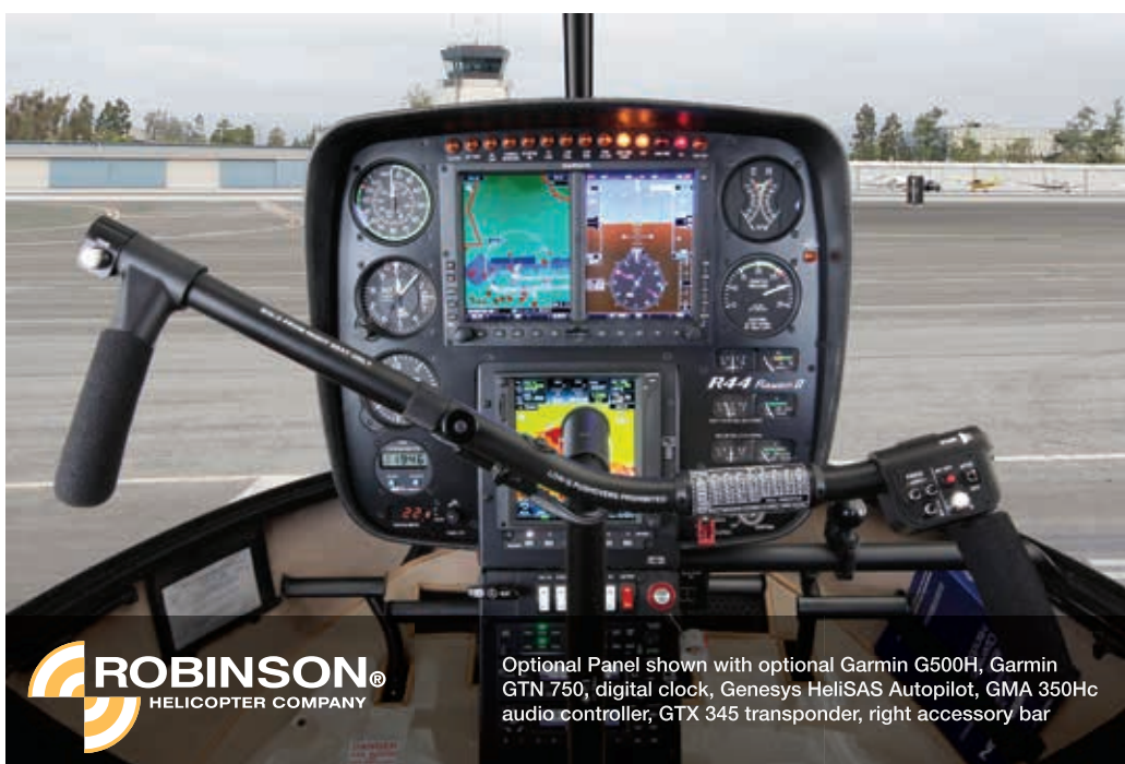
Optional Panel shown with optional Garmin G500H, Garmin GTN 750, digital clock, Genesys HeliSAS Autopilot, GMA 350Hc audio controller, GTX 345 transponder, right accessory bar