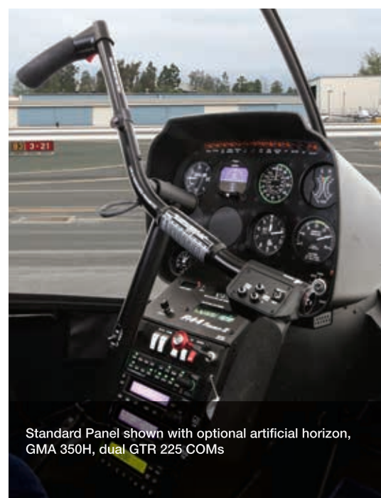
Standard Panel shown with optional artificial horizon, GMA 350H, dual GTR 225 COMs