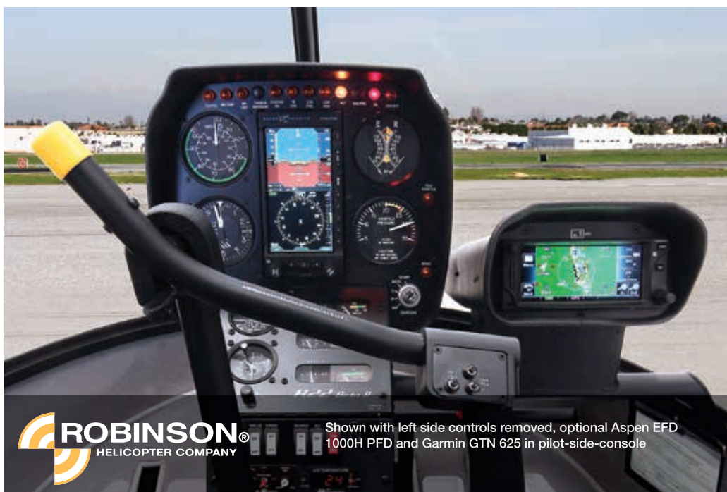
Shown with left side controls removed, optional Aspen EFD 1000H PFD and Garmin GTN 625 in pilot-side-console