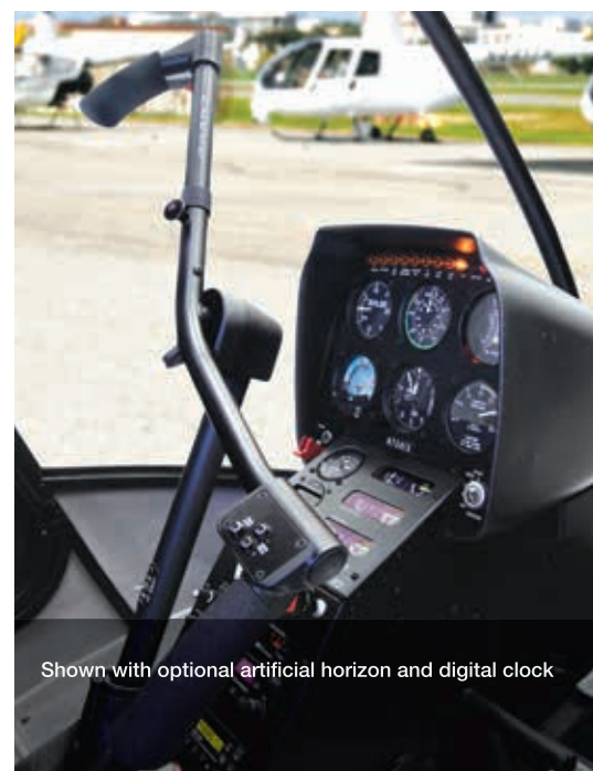
Shown with optional artificial horizon and digital clock